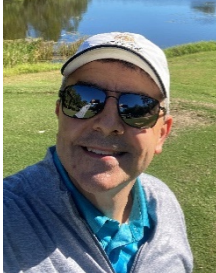
Plant Director CEMEX USA

I was born in the northwest of Mexico, 150 miles from the Arizona Border in Hermosillo Sonora.